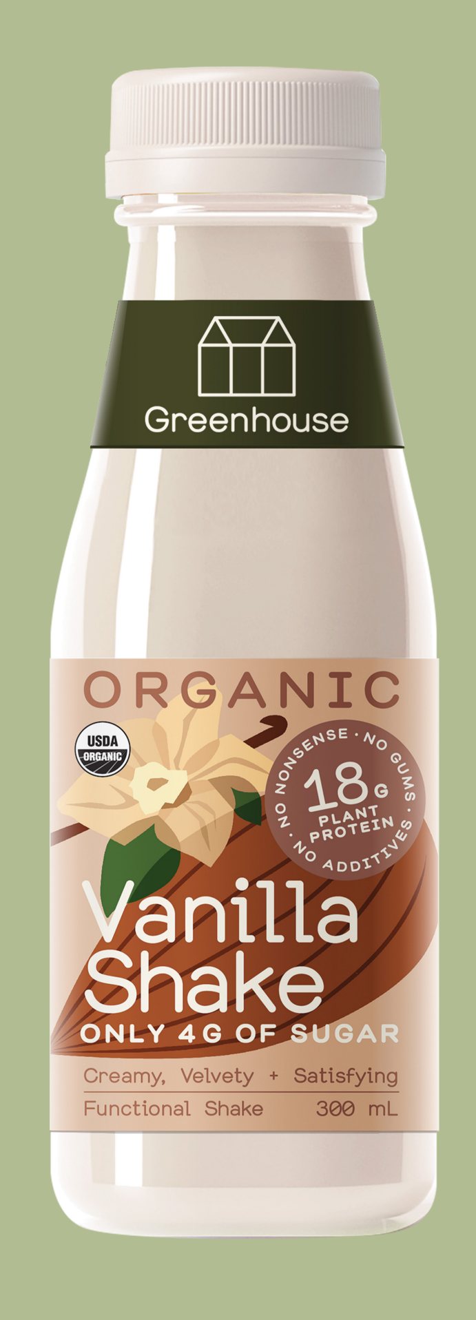
12:00 pm Vanilla Shake