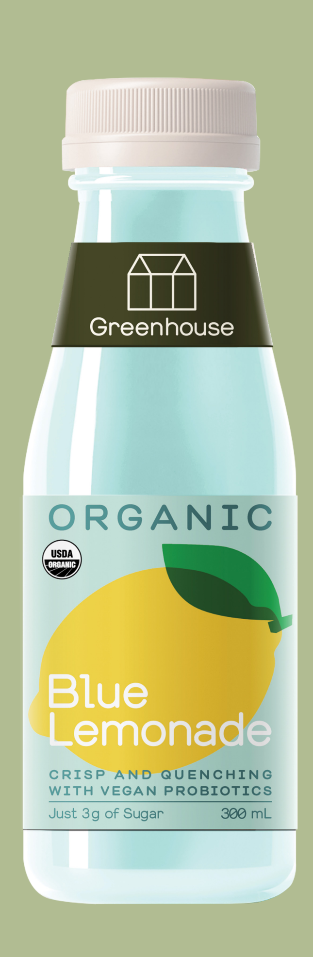
2:00 pm Blue Lemonade