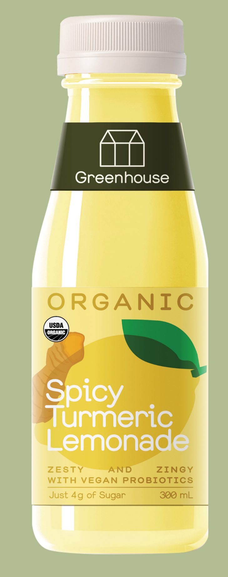
8:00 am Spicy Turmeric Lemonade