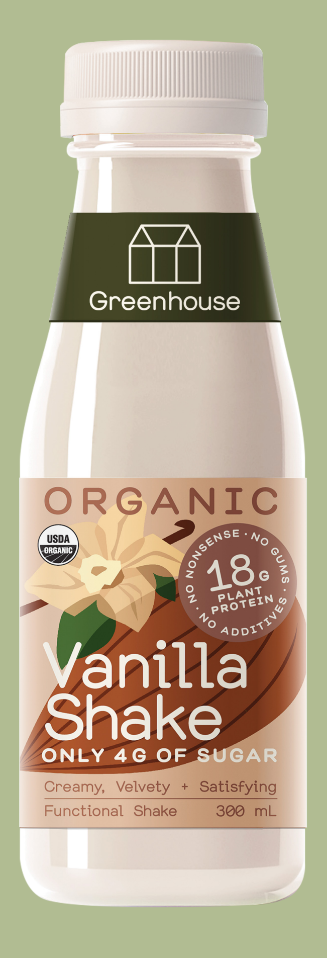
6:30 pm Vanilla Shake