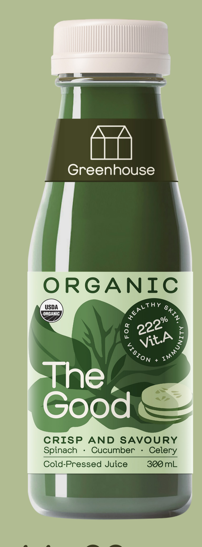
11:00 am The Good