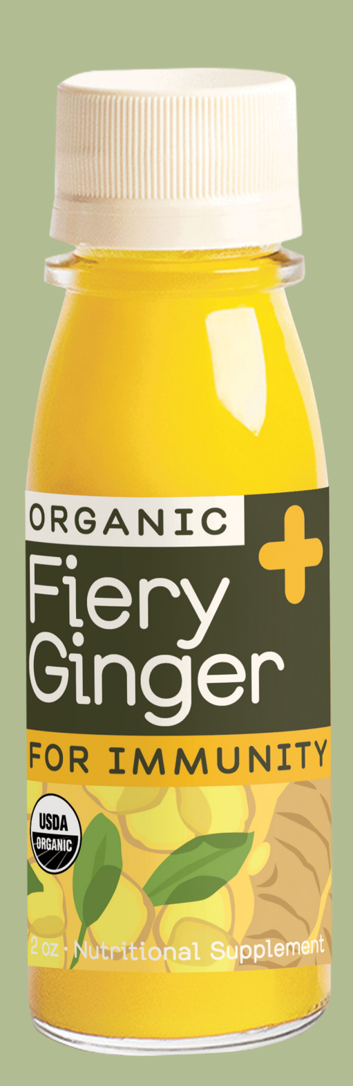
4:00 pm Fiery Ginger