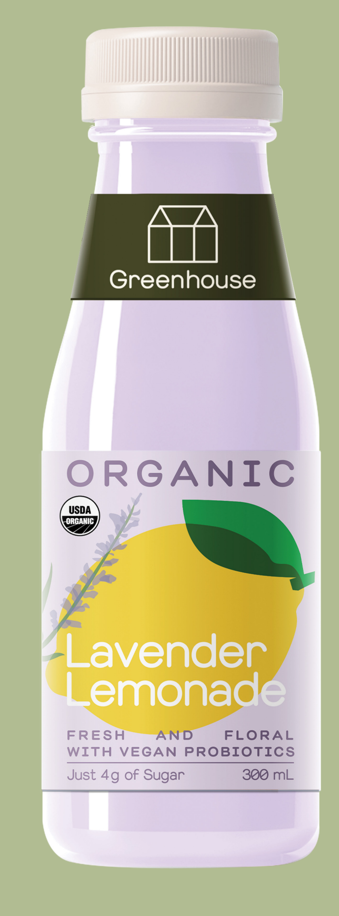
8:00 pm Lavender Lemonade