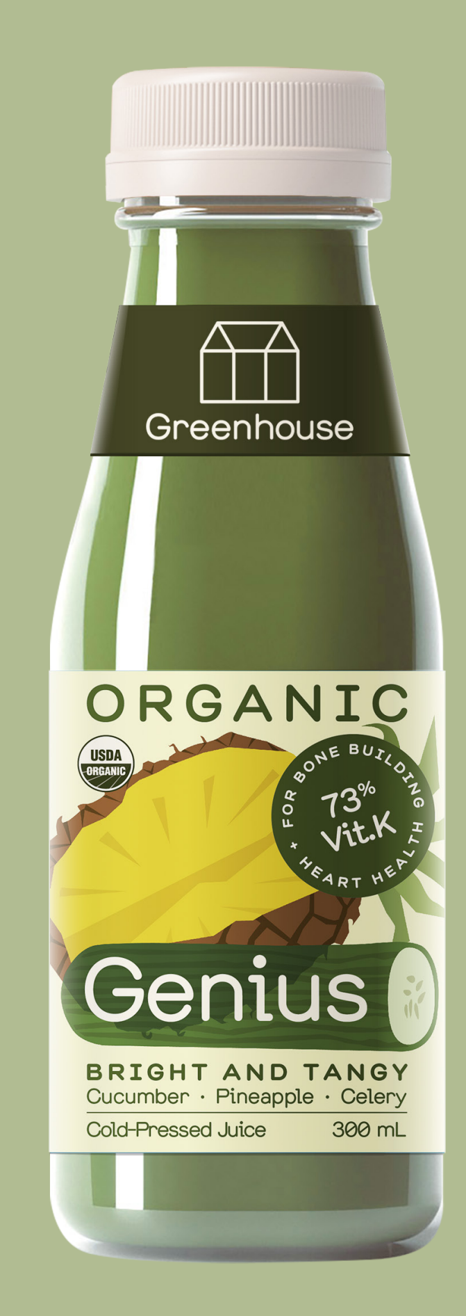
10:00 am Genius