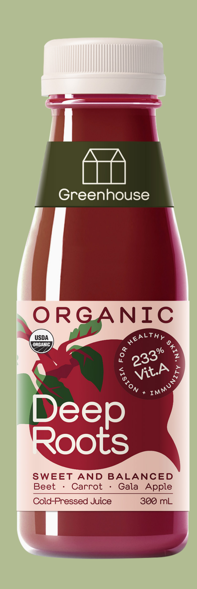
3:00 pm Deep Roots