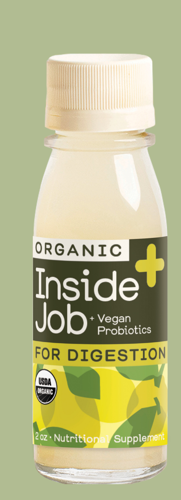
9:00 am Inside Job